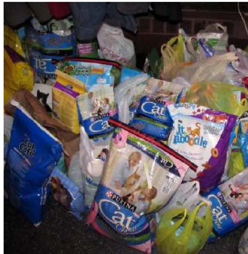
Just some of the cat food & litter donated at our Chinese Auction. The community does it again!

For more info, or to make a purchase, please contact Andrea at 315-823-4680 or Faye at 315-823-4680.