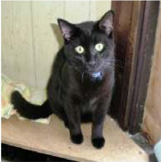
LT is a very sweet, handsome man, named after football player LaDainian Tomlinson. LT is approx. 3 years old & a big lovebug whose world was turned upside down when his elderly dad could no longer care for him. As happens too often, the rest of the family didn't want him. He would love nothing more than to feel safe and secure again with a new family in his furever home!