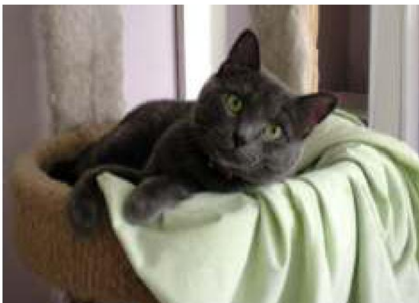
Hi! I'm Marlo, 3-4 years old and very sweet! Won't you please take me home??