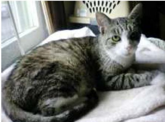
Liberty is a very sweet, very pretty, petite little tiger & white kitty! She is approx. 1 year old and was found by Lock 17 in Little Falls on 4th of July evening, lying in the tall grass and started meowing immediately when approached. It took a little work to catch her, but we think she's very glad we did. She is very friendly and loving and quite the chatterbox!